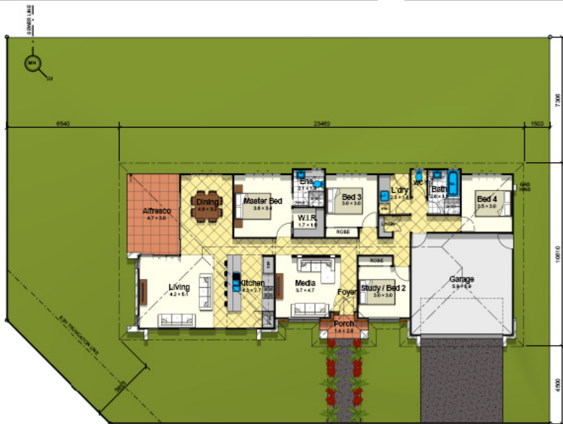
PRESENTATION FLOOR PLAN