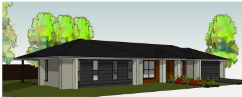
3D VIEW 1

Below is an example of what you can expect from this no obligation service.