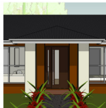
3D VIEW 3